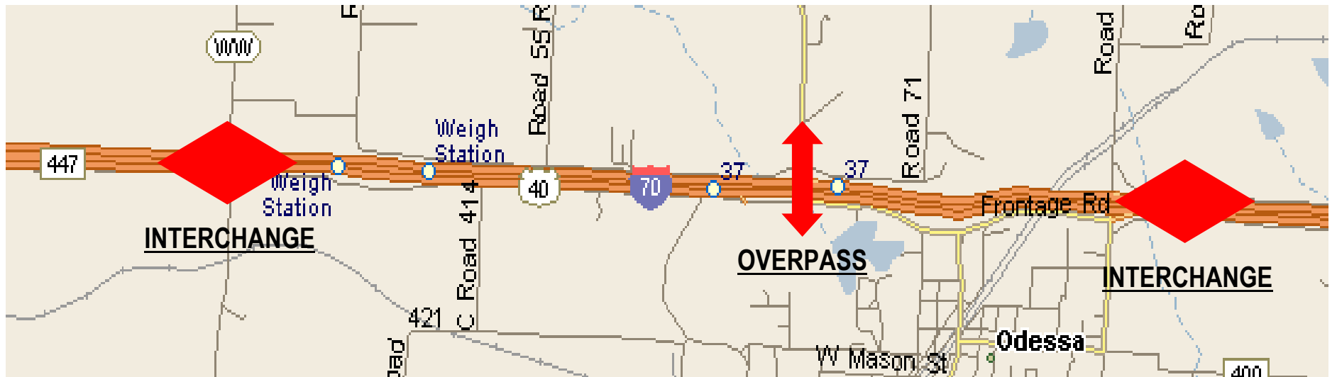
Option A- New interchanges at WW and Johnson Road with an overpass at existing Route 131.

I-70 access in Odessa is a complex issue. MoDOT plans for Odessa to ultimately have two full interchanges rather than the current irregular configuration. We need your input on both interchange locations and interchange designs in Odessa. Under any scenario, a new Johnson Road interchange would be included.